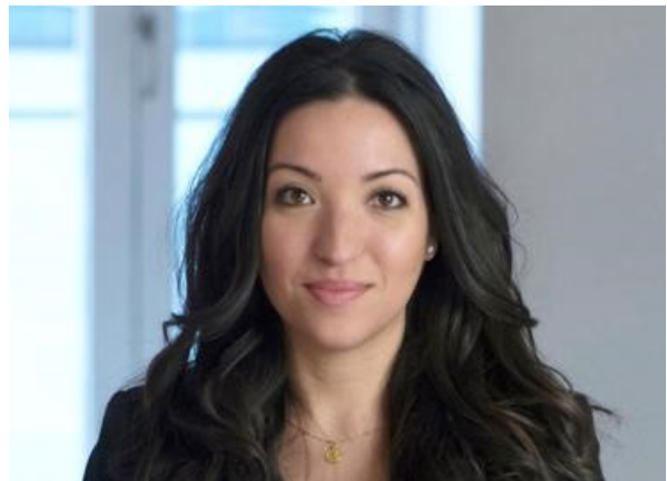
Alumna nominated for RBC Canadian Women Entrepreneur Award